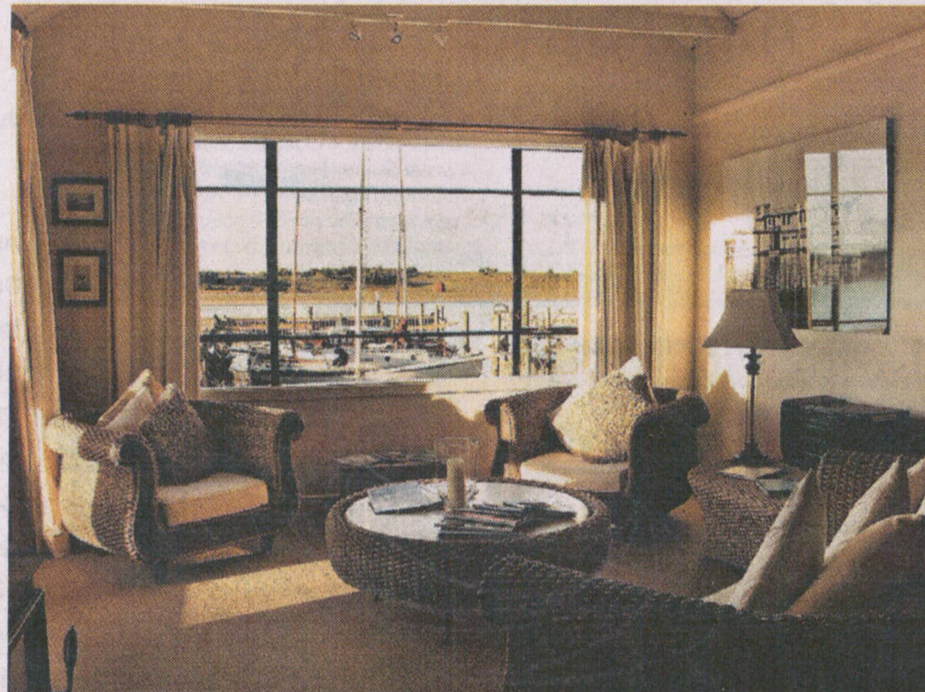
NAUTICAL AIR: The main room of the Boathouse (above and top right) overlooks Birks Harbour Marina while the large deck overlooks and connects to the marina.

The fridge was stocked with more complimentary products (a litre of